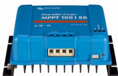
Solar Charge Controller MPPT 100/50