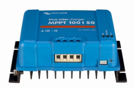
Solar Charge Controller MPPT 100/50